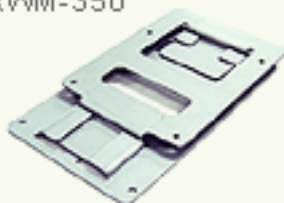
» Wall Mount Bracket